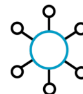
Voice Service Providers

Creates verified relationship between enterprises and telephone numbers.