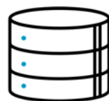
Registered Caller Cache TNs

Integrates with STIR/SHAKEN to help elevate call completion rates.