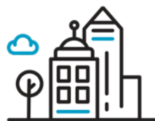
Call Originator Register TNs

Providing Voice Service Providers with verified entity and telephone number information for call treatment, developed based on industry's security best practices.