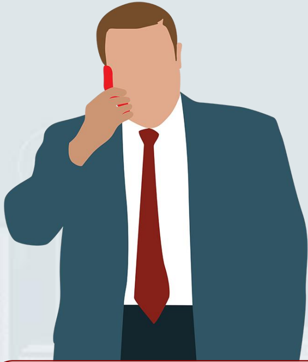
Roamers from the U.S