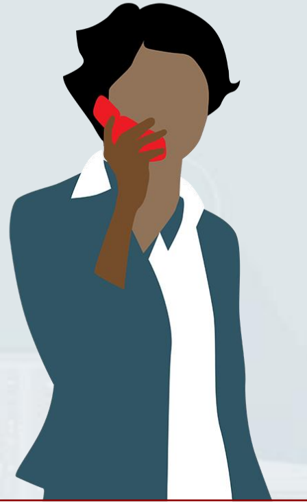
Offshore contact centers