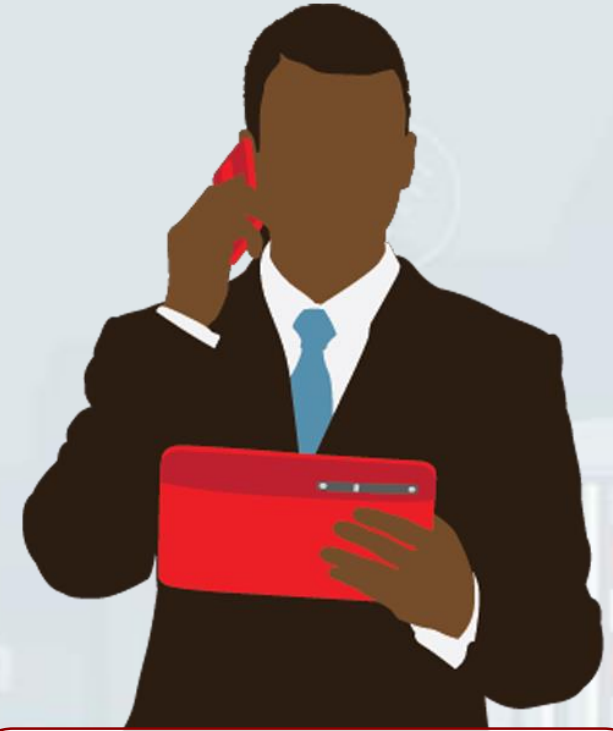
Branch offices, located outside of the U.S